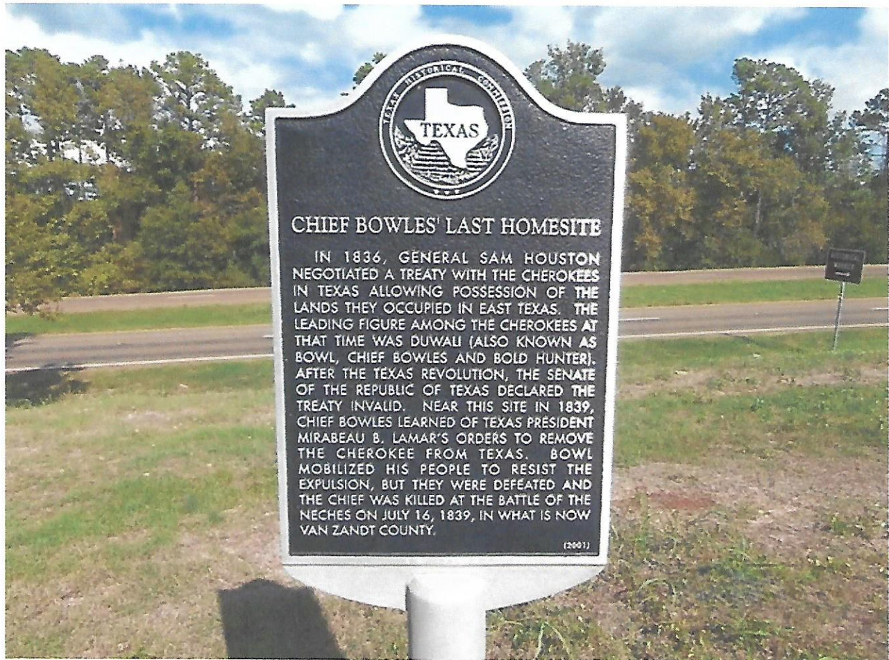
(Texas Historical Commission Marker in Alto, TX. on U.S. Highway 69 North.)